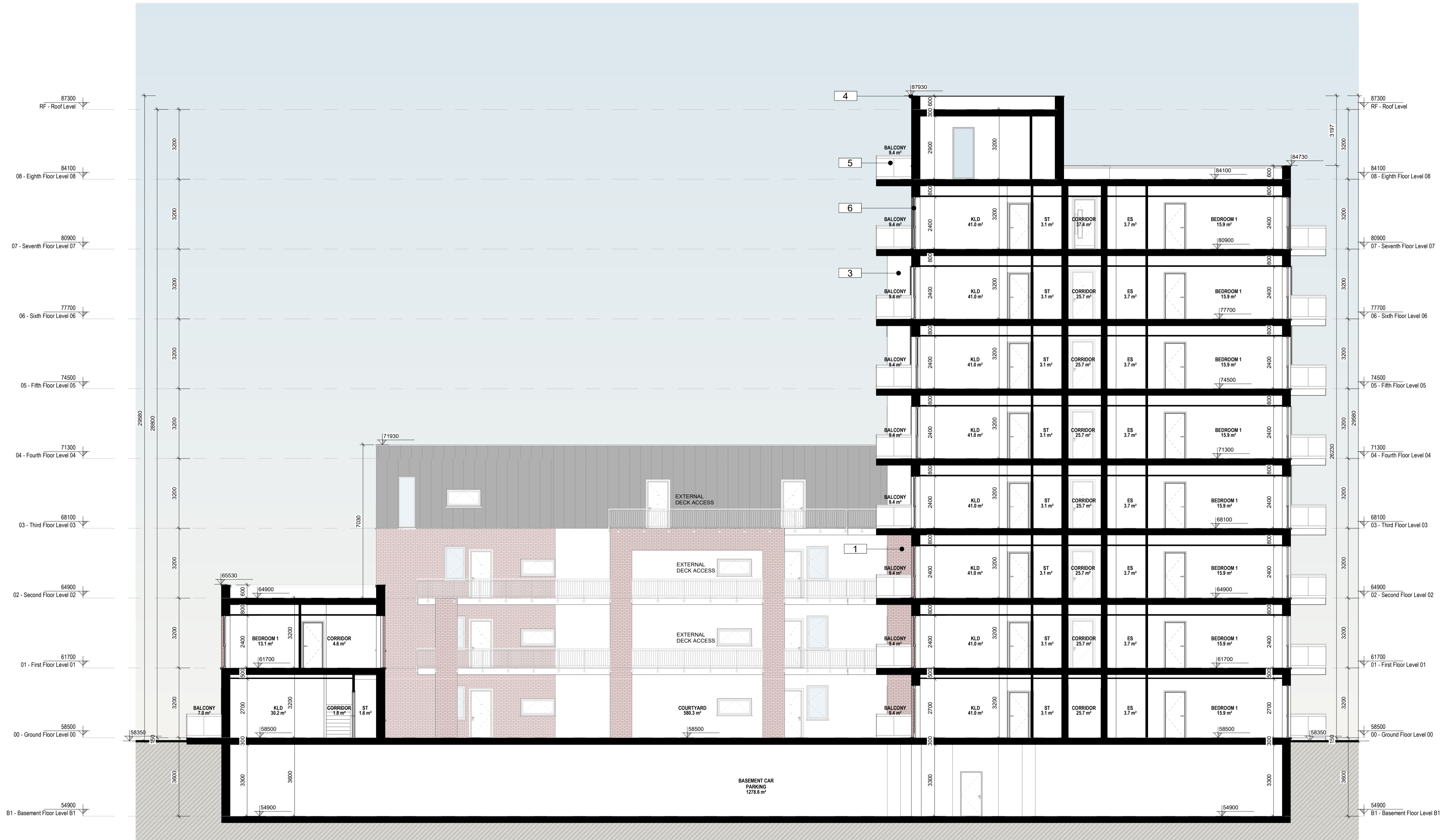
1 Section A-A 1 : 100